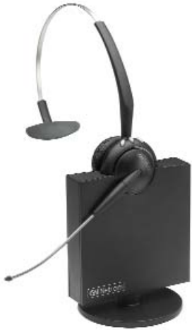
GN 9120 LR Shown with charging base and wireless headset.